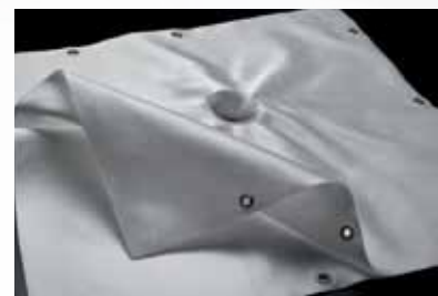
Filter press cloth