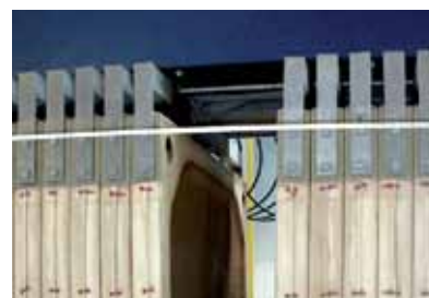
Filter press detail