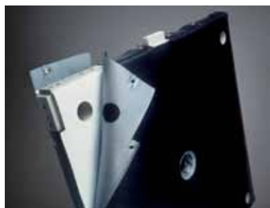
Filter press cloth