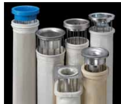
Cages and bags