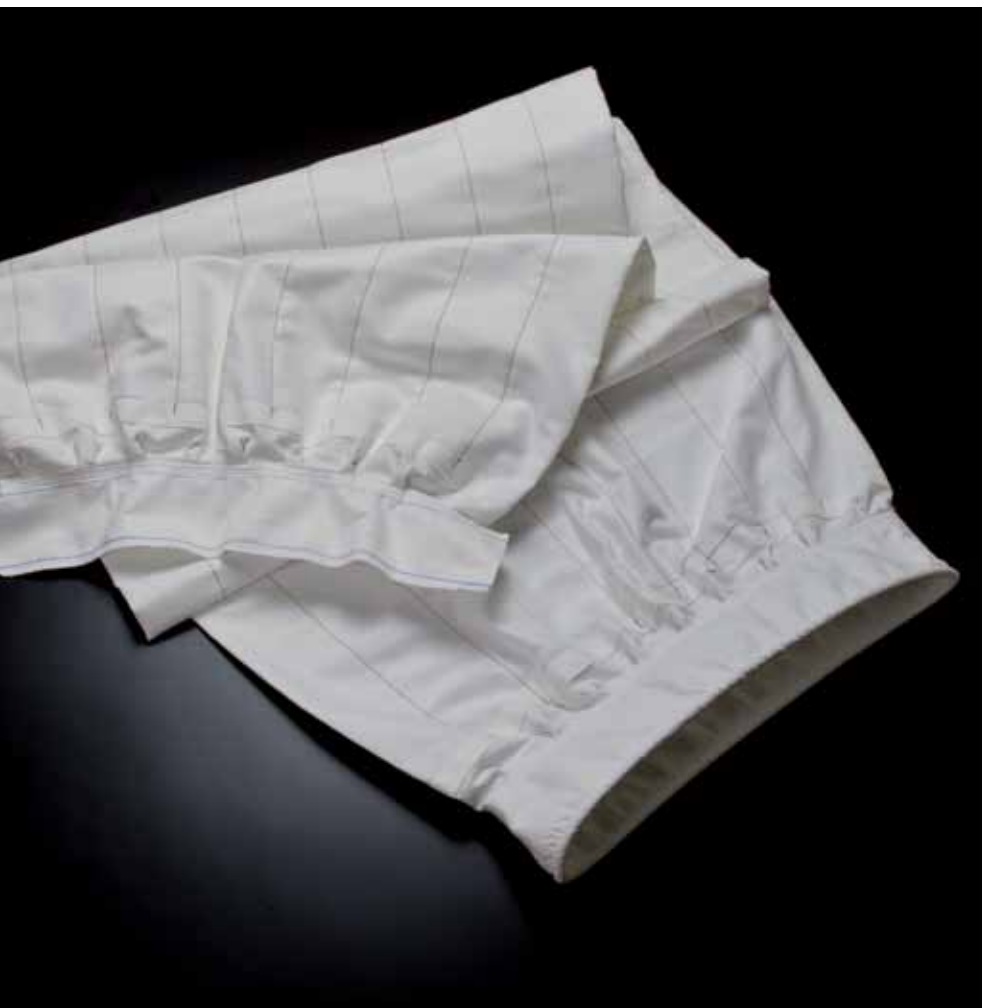
Multi-channel bag (aluminium industry)