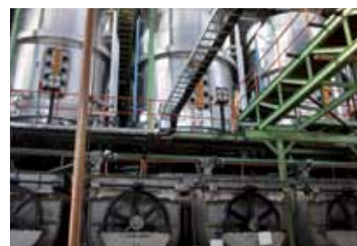
Drum filters - chemical plant