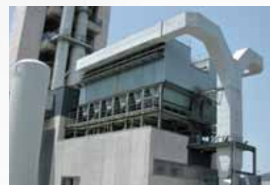
Filters in cement plant