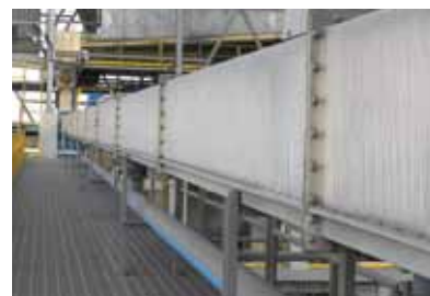
Air slide belt