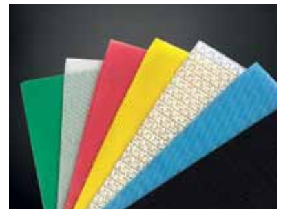
Mono/multifilament woven fabrics