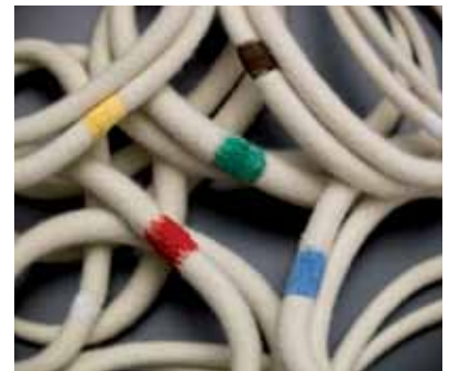
Felt cords - cocoa press