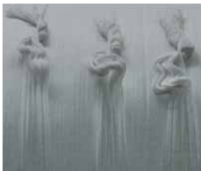
Warping - beam