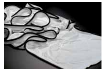
Belt vacuum filters