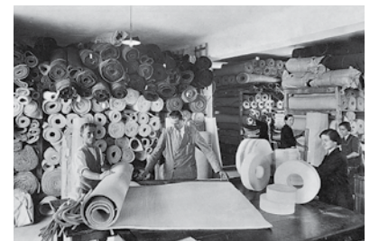
Old Testori manufacturing