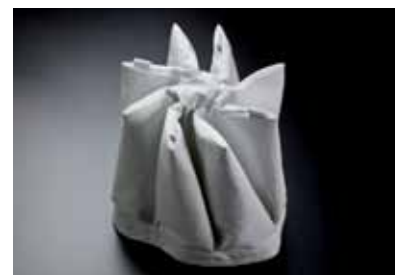
Star bag (vacuum cleaners)