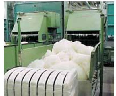
Felt production: staple