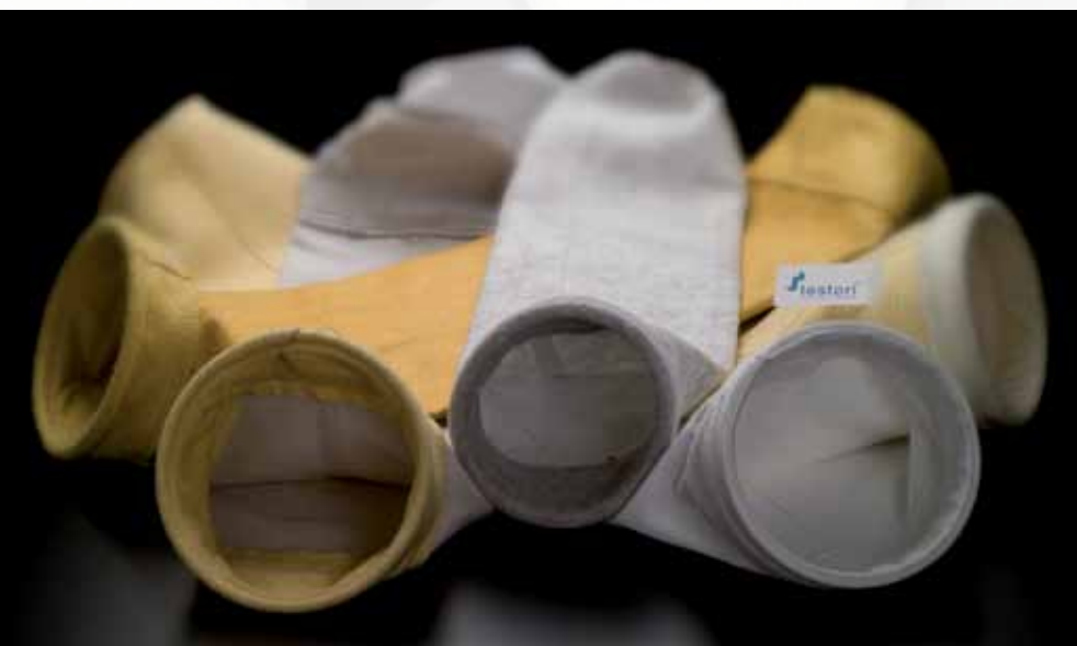
Bags - different felt types

>100 years of experience in industrial filtration >40 years of experience in environmental protection 5 companies devoted to the production of felts, fabrics, bags, cloths and textile items 2 new companies outside Europe 47 % of sales outside Italy 60 % market share in Italy in gas filtration 220 people in the Group 30 thousand square meters dedicated to manufacturing 35 % market share in Italy in liquid filtration 4,5 million square meters/year of needle felts produced 1,4 million/year filter bags produced 150 Thousand/year filter presses cloths 5,5 million square meters/year of filter fabrics produced 20 aluminum smelters supplied by Testori Group 500 thousand bags installed in power generation plants 70 years' experience in the cement industry 10 alumina plants supplied by Testori Group 250 cement plants supplied by Testori Group 80 incinerators supplied by Testori Group 60 years' experience in chemical & pharmaceutical industries