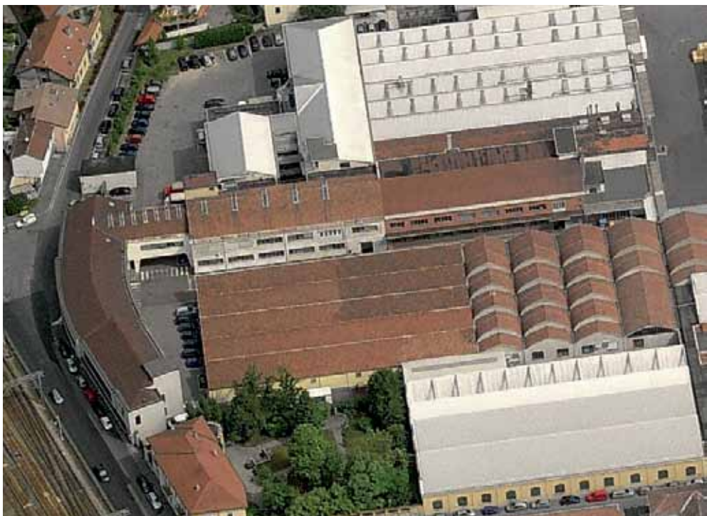
Testori Headquarters (Novate Milanese)