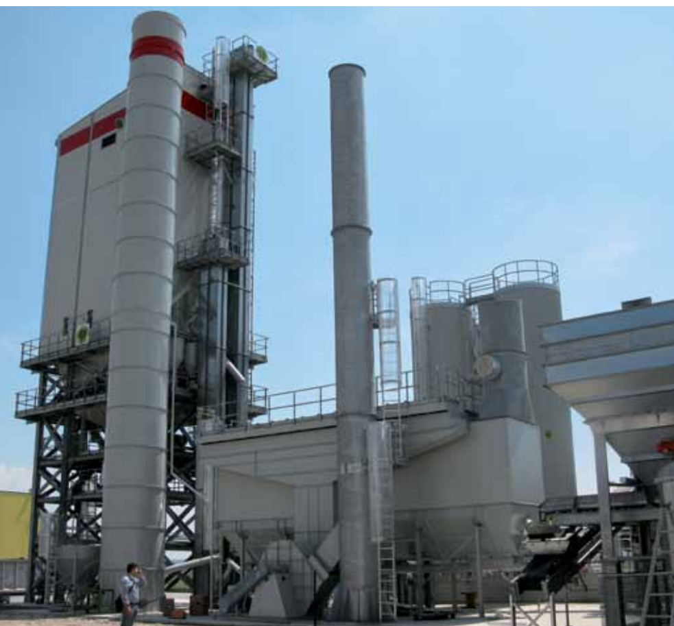
Asphalt plant - courtesy of Bernardi Impianti

Gas filtration adopts mainly felts (but also fabrics) while liquid filtration uses mainly fabrics (but also felts). Felts and fabrics are supplied both in rolls and hand made products.