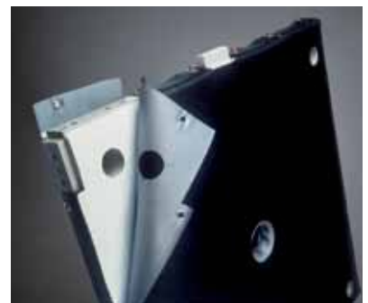
Cloth for filter press