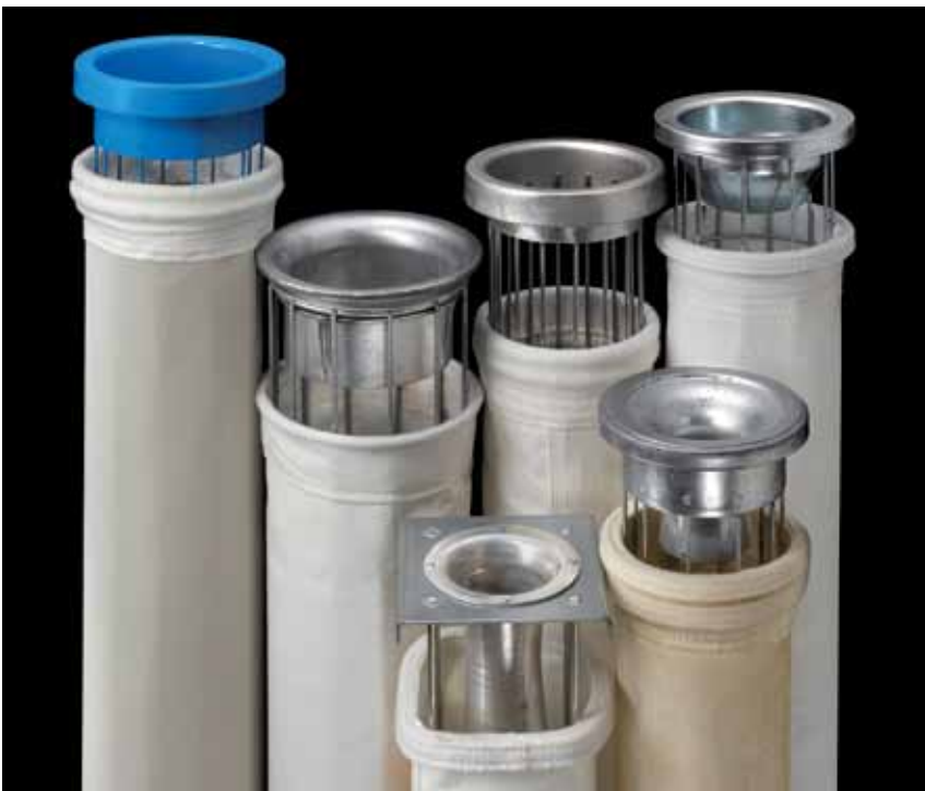
Bags & Cages