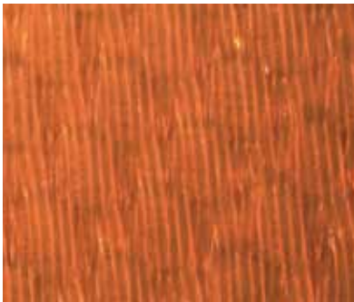
Woven fabric - detail

Efficiency test method can be run also in accordance of ISO 11057-2011 and ASTM D6830-02 standard.