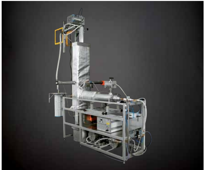
VDI - Efficiency test